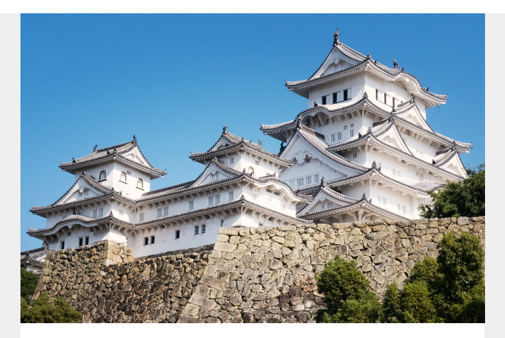
Registrations are open! Find out more about WMG Kansai 2021